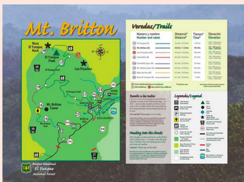
Map and Information for Mt. Britton Trails

Note. This is a map of Mt. Britton trails with information about the trails. A permanent map like this one can be added to the Rio Sabana Trails to help hikers understand the distance of the trail and where it leads to.