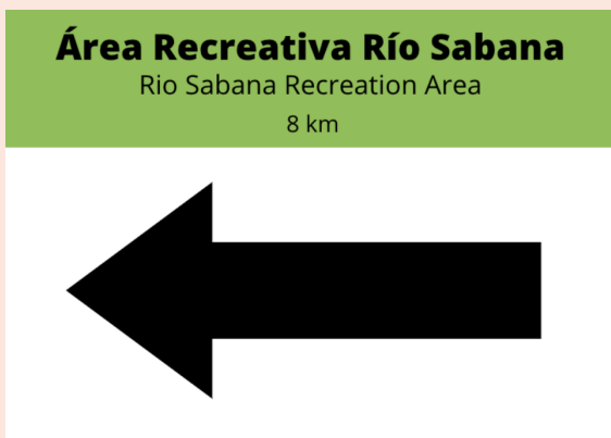
Figure 2: Example of Directional Road Sign for the Rio Sabana Recreation Area