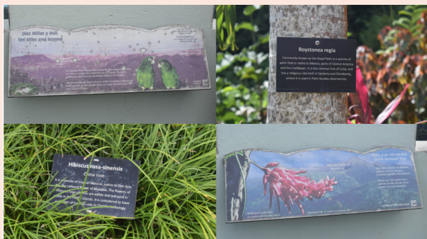
Examples of Informational Signs about Flora and Fauna

Note. These images were taken of signs in northern El Yunque (upper-left and lower-right) and the bed-and-breakfast Casa Flamboyant (upper-right and lower-left).