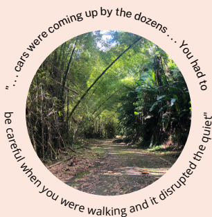
(M. Ciota, personal communication, November 6, 2021)