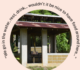
(Rio Saana visitor, personal communication, November 20, 2021)

"Social" visitors are visitors who usually arrive in larger groups or multigenerational families. These visitors are not usually adventurous and want easily accessible places. They typically spend time enjoying each other's company, the river, and the picnic shelters. Most often the families are from Naguabo and come for day trips. These visitors would appreciate informational signs throughout the area.