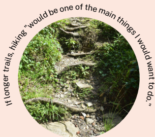
(A.Caspari, personal communication, November 29, 2021)